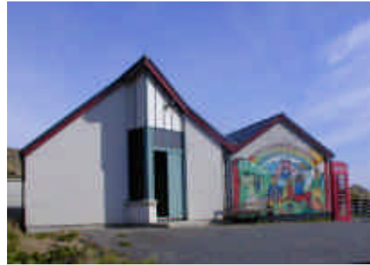
Fetlar's award winning Interpretive Centre

9.4 A retreat complex run by an order of nuns at Tigh-Sith on Aith Ness also attracts visitors to the island.