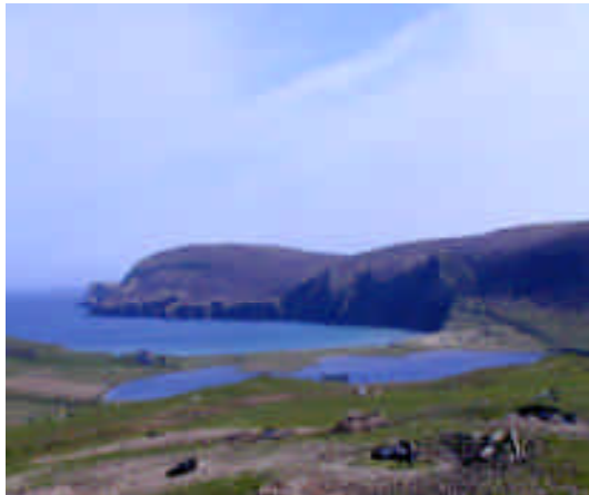
Lamb Hoga and Papil Water

1.1 Fetlar is one of Shetland's Northern Isles, a fertile green place known as the 'Garden of Shetland'. The island is generally low-lying, the highest point being Vord Hill at 158m, and the coastline is largely cliffs. Tresta Bay, however, has one of the best beaches in Shetland. Fetlar covers an area of 15 square miles (24km). The island is approximately 6 miles (10km) across and varies from 1 to 3 miles wide. It is situated 2 miles (3.2km) to the east of Yell.