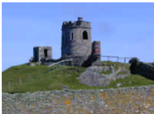
Brough Lodge Observatory