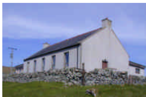
Fetlar Community Hall

14.6 Fetlar Hall: has been granted a £27,000 award under the Local Capital Grants Scheme to extend the hall on the south side to provide a multi-purpose community social room as well as a room dedicated to I.T. equipment for training and learning purposes.