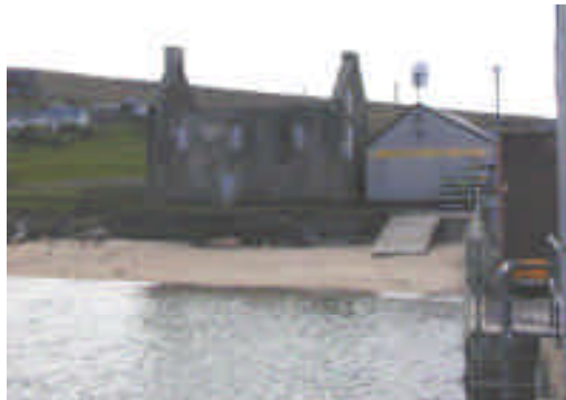
Linkshouse at Mid Yell Waterfront

The Mid-Yell Waterfront Development group is seeking to develop a number of improvements to key facilities and the local environment. This includes improving the shelter for the existing pier, restoring the listed Linkshouse building for use as a crafts centre, providing a new boating club and marina, creating additional car parking and carrying out a number of environmental improvements.