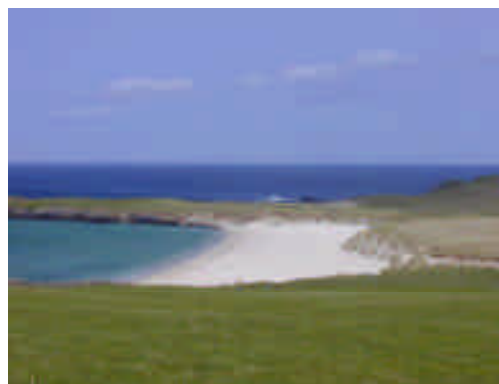
Sands of Breckon

3.4 The other main settlements in Yell are Burravoe in the south, West Sandwick on the west coast and Cullivoe in the north, where the Council has recently constructed a new pier for use by the fishing and aquaculture industries.