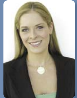
Kirsty McCabe, *BBC Weather Presenter

On the roads, a sudden change in the weather can make for dangerous driving conditions like slippery surfaces or reduced visibility. Driving in winter weather can be especially hazardous.