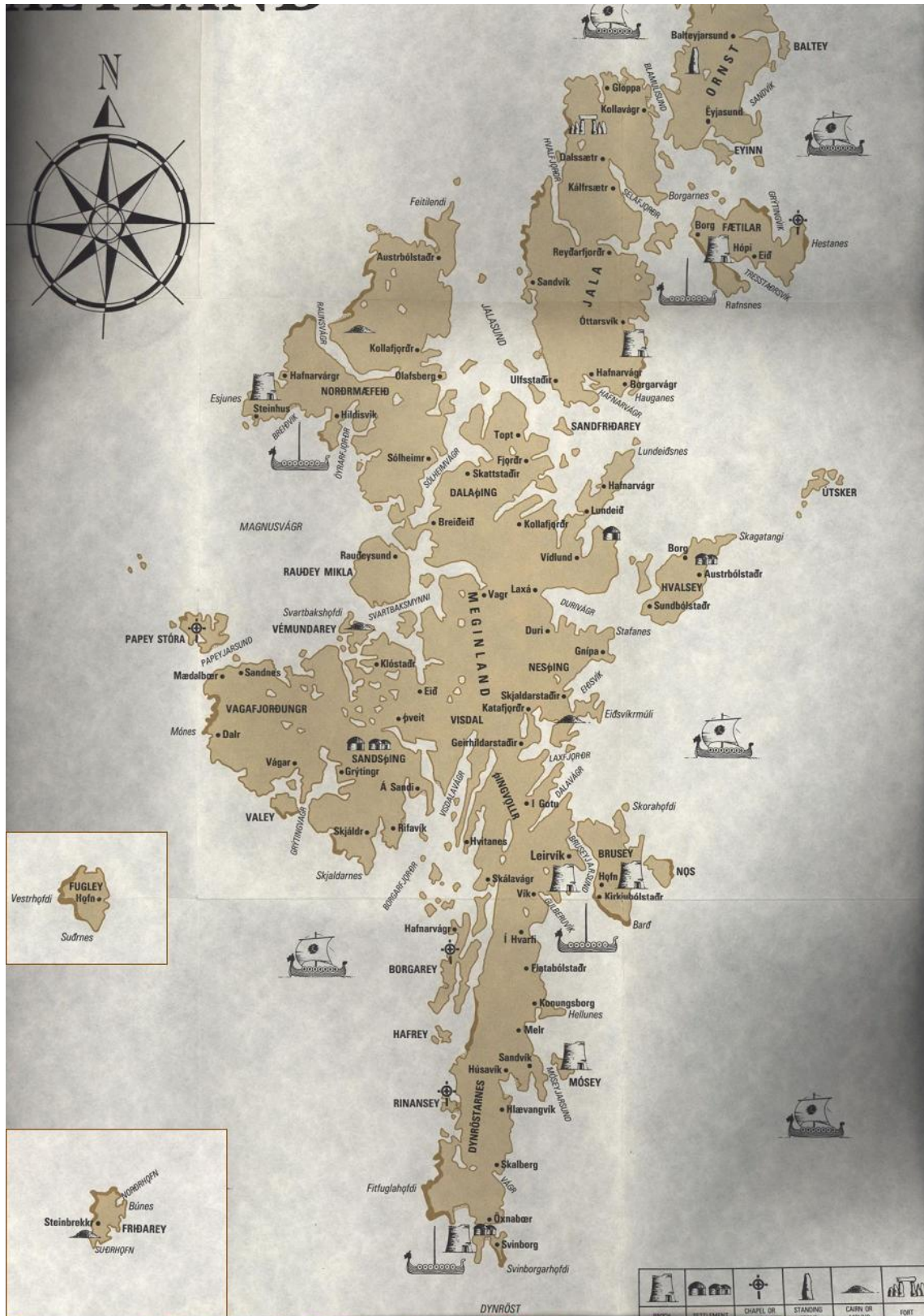
This is a map of Shetland in the Old Norse language. In this language, Shetland is called Hjaltland, Lerwick is called Leirvik, Yell is called Jala and St Ninian's Isle is called Rinansey. In this picture, Foula (Fugley) and Fair Isle (Friðarey) are placed in insets. From R. Grønneberg's 'Hjaltland', 1991, (Shetland Times Ltd.)