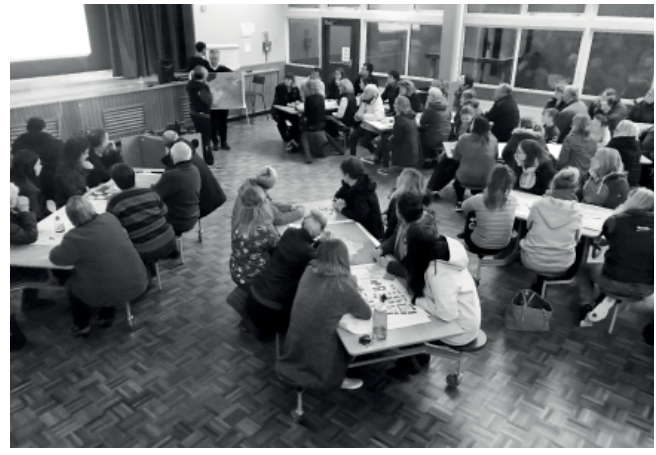
First consultation event at, the now former, Anderson High School

This second community consultation event on the future of the Knab site was organised to further explore issues and proposals raised by the community at the first event which was held on 7 November 2017.