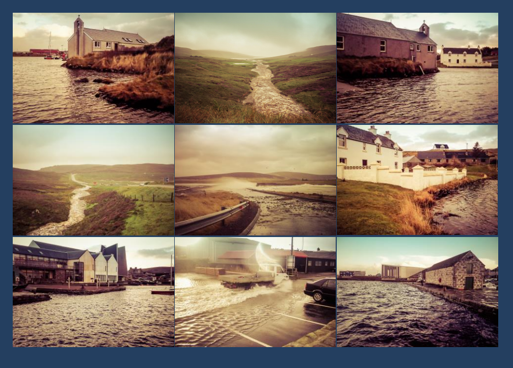
Published by: Shetland Islands Council