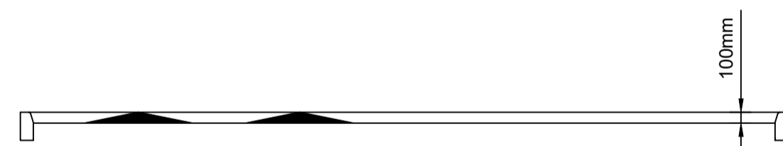
FLAT TOPPED HUMP DETAIL SECTION B-B SCALE 1:50