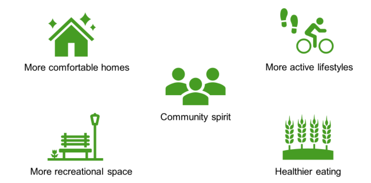
Figure 1: ways in which communities can benefit from climate action (taken from workshop slides)

Finally, it was noted both by the project team and by some of the workshop participants that there is already an impressive level of knowledge on climate change across the Shetland Islands. This provides a solid platform for further engagement on climate action.