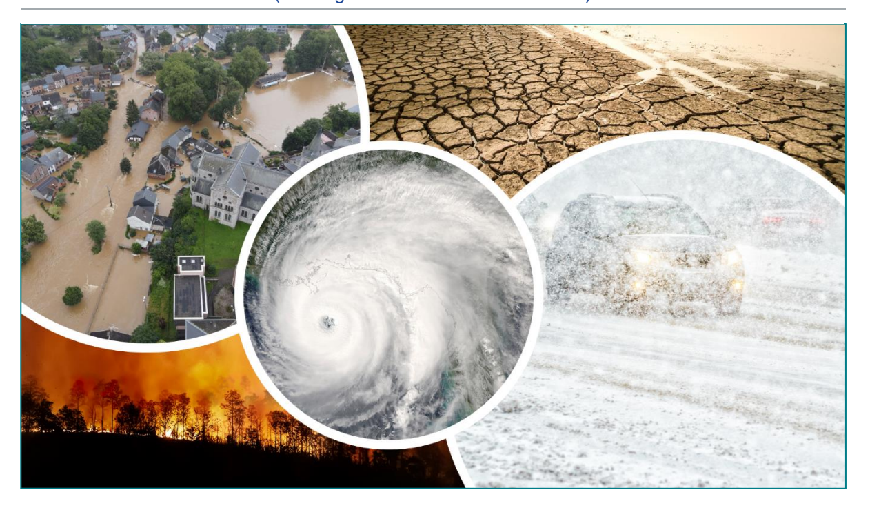
Figure 8: Examples of the climate change impacts we face and need to adapt to.