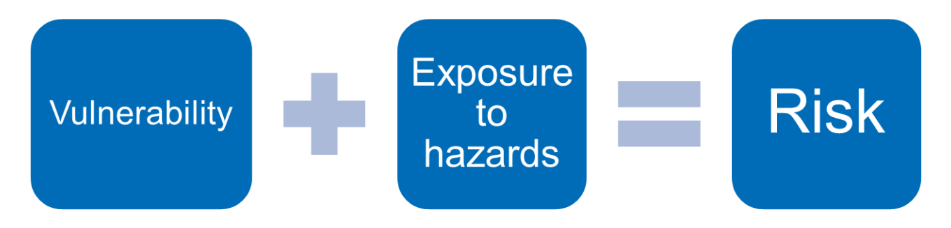
Figure 2: climate risk as a function of exposure to hazards and vulnerability to those hazards

This discussion around vulnerability also helped localise the discussion, as vulnerability ideally needs to be considered at the local level. After introducing the concept of vulnerability outlined in Figure 2, we received a number of interesting local examples, for example of low lying roads or bridges that were vulnerable to coastal flooding. Having this more localised discussion, as opposed to a more generic discussion about climate impacts, would therefore be a good way to get more engagement on this topic.