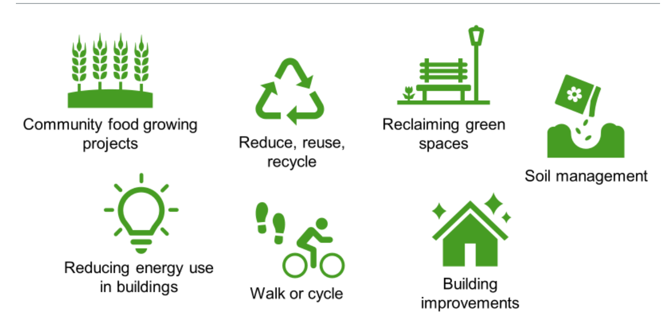
Figure 4: examples of community action on climate change

We have grouped together the insights from the discussions on community-level action into a number of statements, as follows: